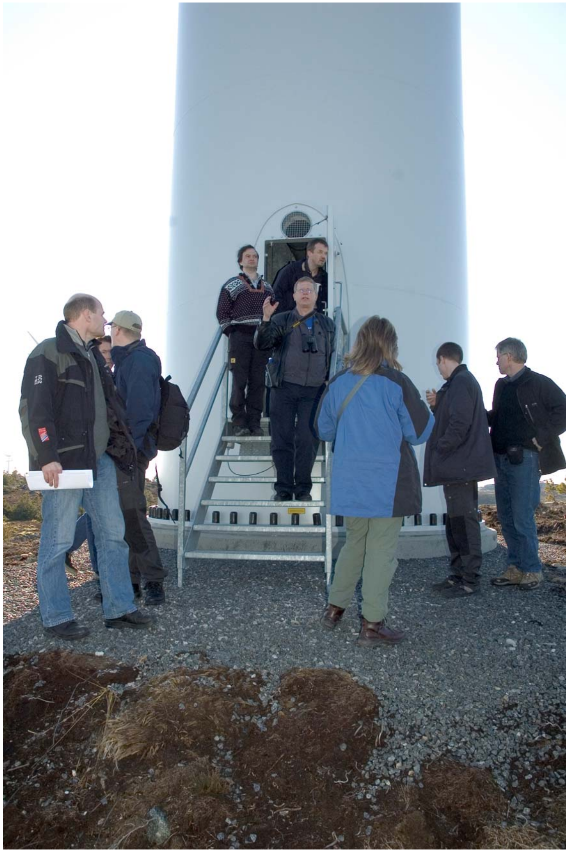
Visit to Smøla wind park, 26th March 2007.